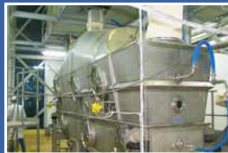
Typical Dairy Fluid bed all stainless steel construction with automated weir plates and water removal ducts on the underside for CIP recycle.