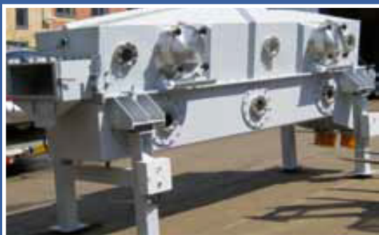
A continuous fluid bed for the Chemical Industry mounted on pneumatic inflated vibration isolators.

Our extensive range of fluid bed products are designed in specific specifications to satisfy the rigorous requirements of the Dairy, Food Processing, Chemical and Pharmaceutical industries all of whom require differing variations.