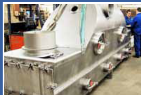
A sanitary fluid bed manufactured in 316 stainless steel for the production of protein powders under construction. The clean lines of this machine make it ideal for use in the food and dairy industry.