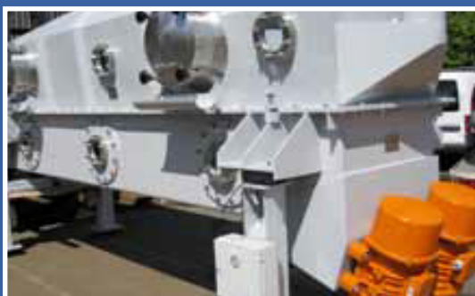
Twin vibrator motors on the rear of the machine.